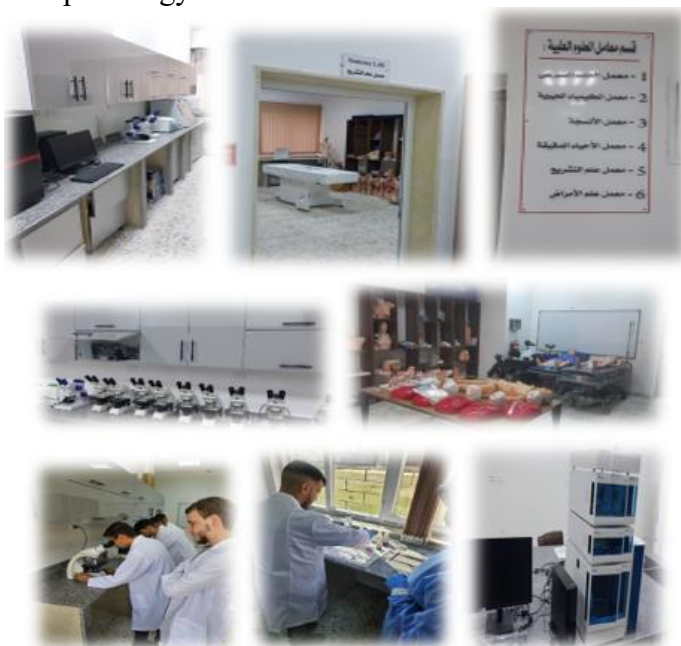
Figure 3-1: Laboratories of the Faculty of Medicine

ELMERGIB UNIVERSITY seeks to equip its students with fundamental and advanced medical knowledge and improve their skills in diagnosis, treatment, and scientific research across various medical specialties. This is achieved through the faculty's specialized skills laboratories, such as those for internal medicine, surgery, paediatrics, otolaryngology, ophthalmology, obstetrics and gynaecology, and other disciplines, thereby enhancing their practical competence and clinical skills. These laboratories and their equipment also combine theoretical study with practical application through labs for histology, microbiology, biochemistry, anatomy, and pathology.