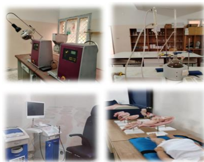
Figure 3-3: Faculty of Medical Technology Laboratories

Faculty of Medical Technology has also been provided with a number of laboratory devices in order to provide outstanding medical education and prepare qualified medical personnel capable of providing health services and care, in order to provide university students with basic medical knowledge and develop their skills through these devices.