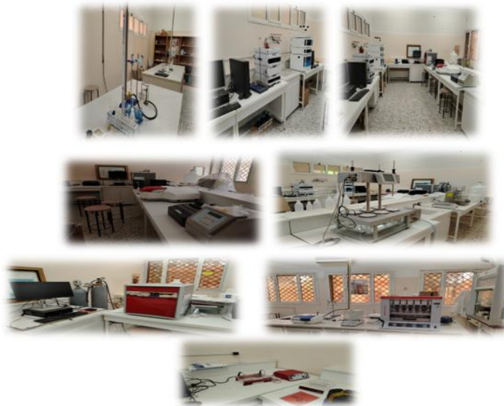
Figure 3-2: Faculty of Pharmacy Laboratories

Several training courses were conducted on these devices to provide highly qualified technicians to ensure the operation of the laboratories and their service for educational and research purposes. These courses were conducted in cooperation with the Ministry's Laboratory Monitoring and Development Office.